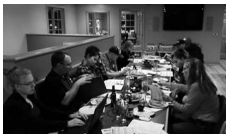
Green County Farm Bureau changes their meeting location on a monthly basis to support local businesses in Green County. The January meeting was held at Sugar River Pizza in New Glarus.

The board also finalized plans for the 2016 Ag in the Classroom essay contest along with sponsorships and awards. They made plans