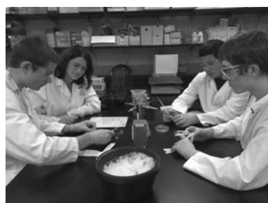
Students enjoyed a hands-on biotechnology workshop.