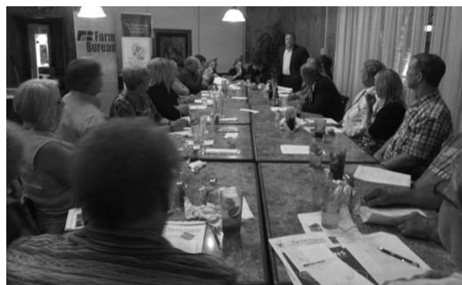
There was a great crowd at the Kenosha County Farm Bureau annual meeting.

Thank you to all the members who attended this year's annual meeting! We look forward to seeing you again next year!