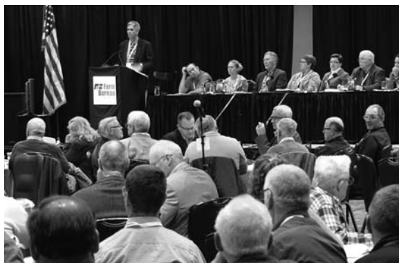
The WFBF Policy Development Committee addressed the resolutions before the delegates at the WFBF Annual Meeting.