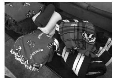
Badger Blankets is accepting donations of new or used blankets.