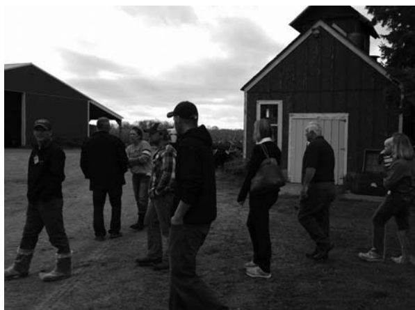
Candidates and guests toured Misty Hollow Farms.

If you have specific questions about the meeting or farm tour, please contact a member of the YFA committee. It was a great networking experience.