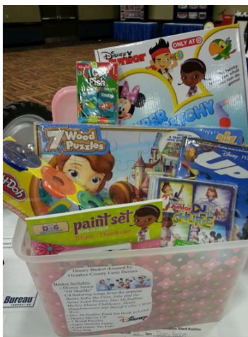
Ozaukee County Farm Bureau donated this Disney silent auction basket for the WFBF Annual Meeting. The basket raised $60 for the WFB Foundation.

Also announced was WFBF raised over $70,000 in funds for the Ag in the Classroom Programs. Various fund raisers held were Golf Outing, Young Farmer Raffle, Trivia Contest and 40x40 Collegiate Program.