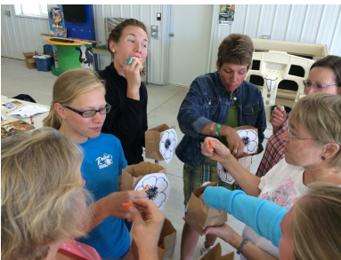
A teacher in-service was held at Roden Barnyard Adventures to help teachers understand the different programs Ozaukee County Farm Bureau has to offer.

The Ozaukee County ag in the classroom committee received a matching grant from the Wisconsin Farm Bureau Foundation. Some of the money was used to host a teacher in-service to help teachers understand what programs Ozaukee County Farm Bureau and WFBF has to offer. There were four teachers in attendance and they learned about a lot of free resources.