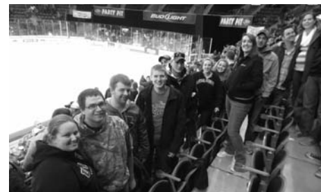
About 33 YFA members attended the District 7 Gamblers hockey game in Green Bay on March 19.

After the game the group met at a local restaurant for pizza and soda.