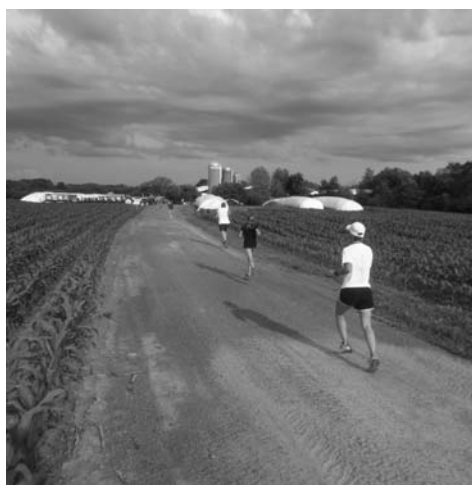
Runners made their way down the home stretch during the 2015 Dairy Dash and Stroll.