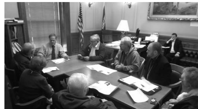
Shawano and Outagamie County Farm Bureau members met with Senator Rob Cowles.