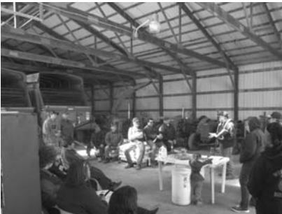
The Shawano County Farm Bureau Dairy Committee met on site to make plans for another successful Brunch on the Farm.