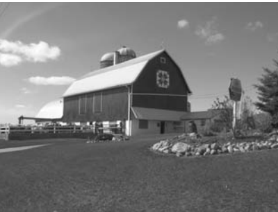
The Bonnin farm will welcome guests to the Brunch on the Farm on June 26.