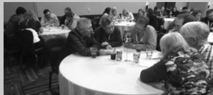
YFA members and the Waupaca delegates participated in the Fun'd the Foundation trivia contest.

The WFBF Annual Meeting was very productive. The moti-