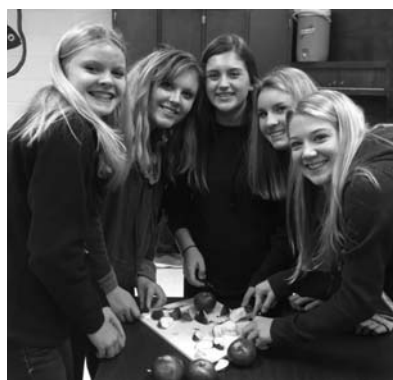
Manawa students tasted apples and cream cheese dip.

The hot cookies and muffins also were happily consumed by the students.