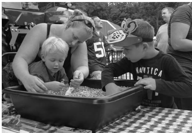
Kids enjoyed playing in the corn to find farm animals and win prizes.

3 Membership Achieved Board of Directors AITC on Facebook 'My American Farm' App WFBF Annual Meeting Book of the Year