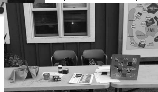
The Milwaukee County Farm Bureau table had a lot of information about the Soybean Science Kit.

Did you know these facts about soybeans?