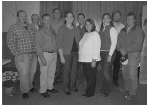
The Taylor County Farm Bureau board of directors after the county annual meeting.

greeted by their president, vice president and Women's chair