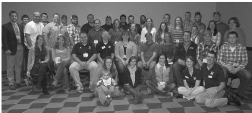
District 1 YFA members during the district meeting on Friday evening.