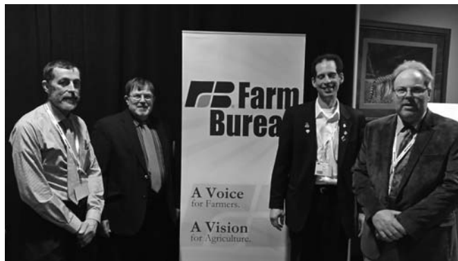
Brown County Farm Bureau delegates attended the 95 th WFBF Annual Meeting to vote on policy.