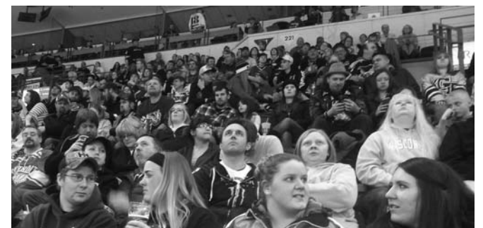
This year's YFA Gamblers outing took place on Saturday, January 24.

About 100 YFA members had a blast at the game and enjoyed pizza after at the Green Bay Distillery.