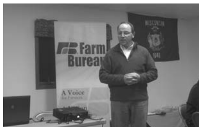
Wisconsin Senator Tom Tiffany told the group about his experiences representing Langlade County in the legislature.