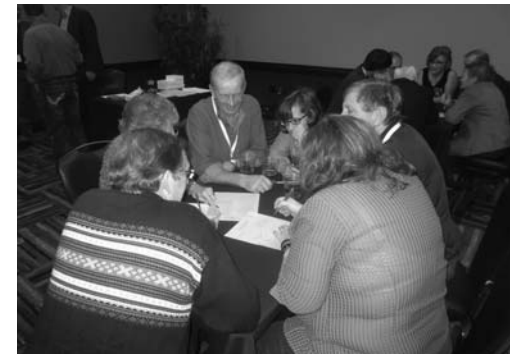
The Langlade County Farm Bureau’s Fun’d the Foundation trivia contest team put their heads together to come up with the answers.

Monday’s business meeting included voting on topics to be worked on throughout the year by Farm Bureau members and legislature committees. The Wisconsin Farm Bureau Strategic Plan for 2015–2020 was introduced and the meeting adjourned at noon.