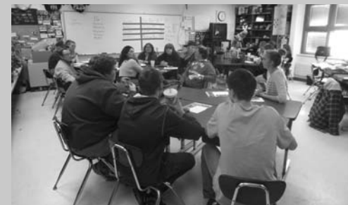
The board of directors meets with the Antigo FFA officers in the Antigo High School Ag Department.

The experience was good for all who attended and we are excited to see how we can partner with the FFA.