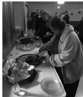
The organizers of the Estate and Succession Planning Workshop made sure no one was hungry.