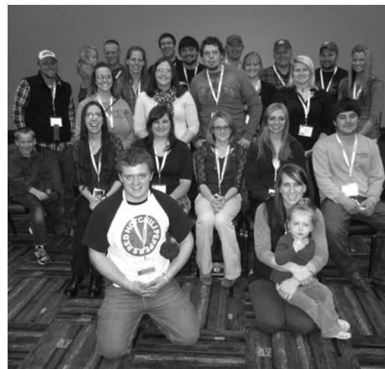
Left: More than 40 YFA members from District 9 attended the WFBF Annual Meeting and YFA Conference.