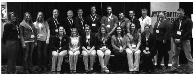
The Collegiate Farm Bureau at UW-River Falls had 27 members attend the YFA Conference. Members listened to keynote speakers, participated in a variety of workshops and networked with other Farm Bureau members.

Second semester will commence on January 26 and our biggest event of the year, Ag Day on Campus, will take place on