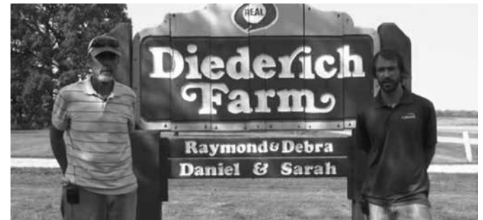
Diederich Farm was awarded the Brown County Farm Bureau Conservation Award at the 2017 Brown County Farm Bureau annual meeting at Graystone Ale House in De Pere.