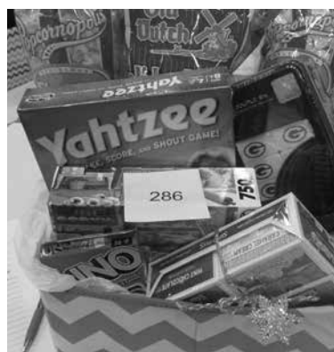
Brown County Farm Bureau donated a family game night basket to the Wisconsin Farm Bureau Foundation.