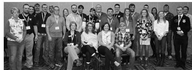
YFA members posed for a photo at the District Meeting during the YFA Conference.

Delegates from the Wisconsin Farm Bureau's 61 county Farm Bureaus also voted to support: