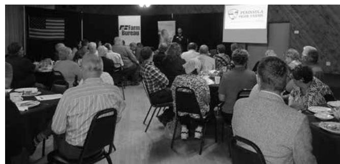
Calumet County Farm Bureau members took a break from corn silage harvest to attend the 75th annual meeting.