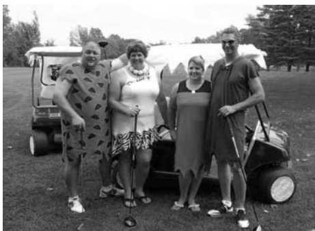
Above is the team that was awarded best dressed.