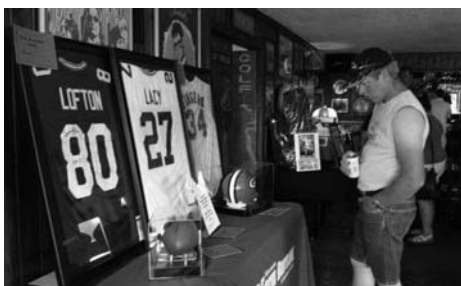
There were many prizes and raffles for golfers to participate in. A huge thank you goes out to all the sponsors and businesses that donated prizes.