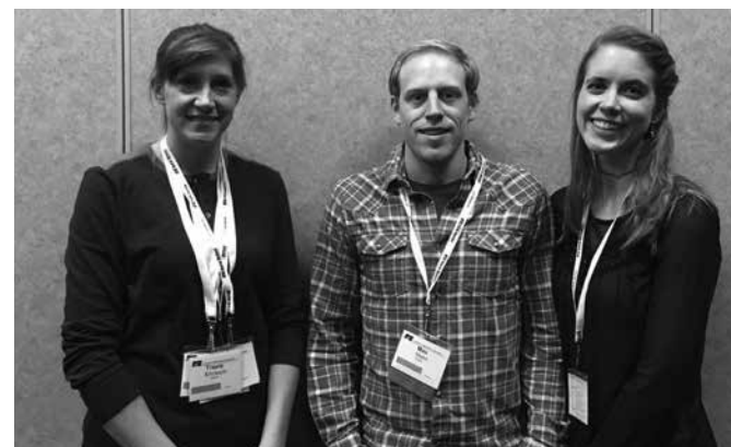
This year, Clark County had three YFA members who attended the YFA Conference held on December 1-2.