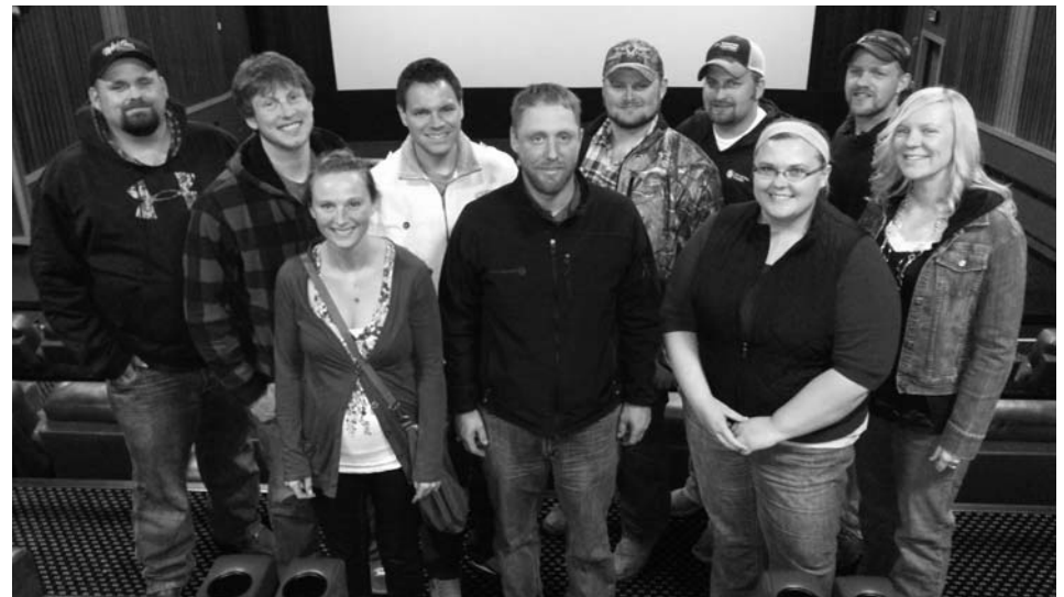
YFA members from District 9 travelled to Oakdale, MN to see a showing of the new film, "Farmland".