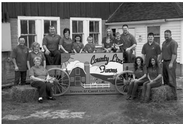
The Dunn County Dairy Breakfast was held Saturday, June 7 at County Line Farms near Elmwood.