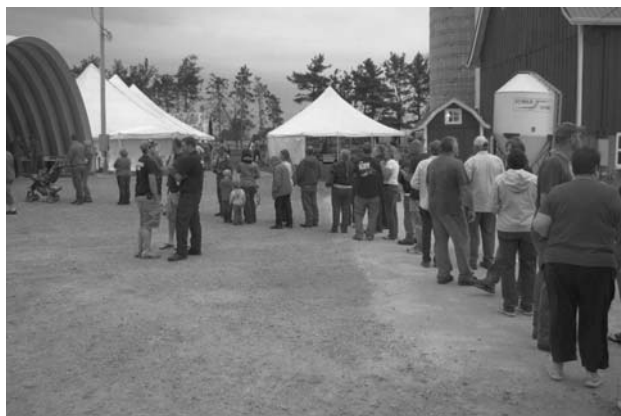
Attendees waited in line to enjoy a great breakfast.

The 2015 Dunn County Dairy Breakfast will be held on June 6 at Maple Hills Dairy.