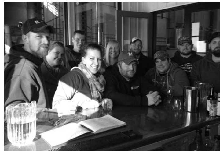
Above: Members posed for a photo in the tasting room of 45 th Parallel. The educational tour drew 25 people.