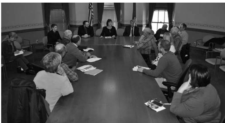
Dunn County Farm Bureau members met with Senator Sheila Harsdorf and Representative John Murtha during Ag Day at the Capitol. The topic of discussion was implements of husbandry.