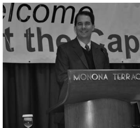
Governor Scott Walker addressed farmers and agriculturists during Ag Day at the Capitol.