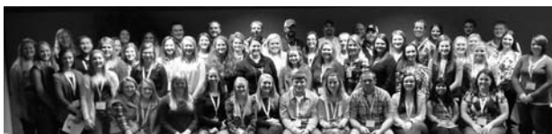
District 2 had an excellent turnout at the district meeting on Friday of the YFA Conference. Members enjoyed an interactive, get-to-know you game of Giant Jenga.

For more information, visit wfbf.com/programmevents/promotion-and-education/playbook . If you have a 'play' to add or questions regarding 'Playbook,' please contact me.