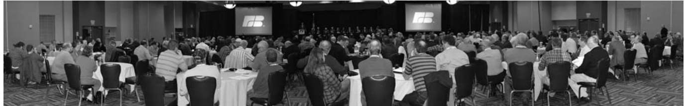
During the resolutions session at the WFBF Annual Meeting, delegates voiced their support or opposition to proposed resolutions.