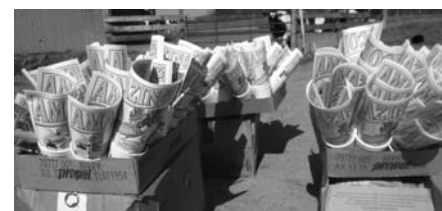
Students got a t-shirt and ag information.