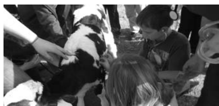
Students listened to the calf's heartbeat.