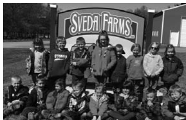
Pleasant View Elementary kindergarteners toured Sveda Farms. The tour was cosponsored by the Langlade County Farm Bureau.

We passed out cow backpacks filled with promotional goodies that the Langlade County Farm Bureau helped purchase. We hope to do it again next year. Have a safe and prosperous summer!