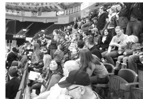
Forty six District 7 YFA members attended the Green Bay Gamblers hockey "Dairy Night".