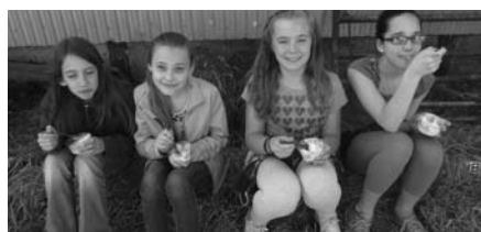
What do dairy production and maple syrup production have in common? Maybe ice cream with maple syrup topping.