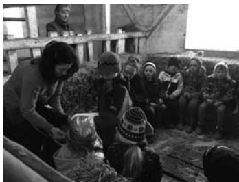
The students on the Sveda Farm Tour named a calf and took turns feeding.

Another spring has sprung and another kindergarten class trip to the farm is here and gone. Pleasant View Elementary accepted an invitation to tour Sveda Farms LLC. The students had so much fun meeting a day-old calf. Mr. Jr. calf, the name they gave him, made them squeal and laugh when he decided to go to the bathroom right in front of them.