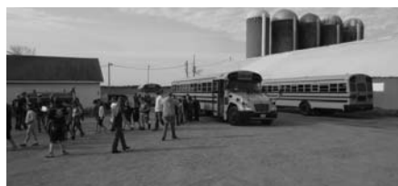
More than 200 elementary school students from Langlade County attended.