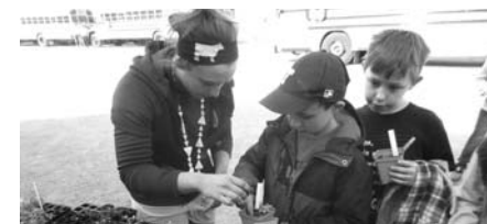
Students created their own pot of flowers from the FFA greenhouse seedlings.