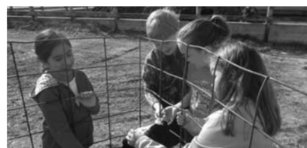
The calf care station was a big hit.