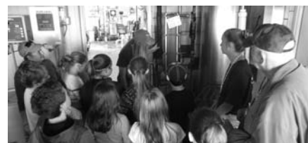
Following the milk from cow, to cooling and to storage.