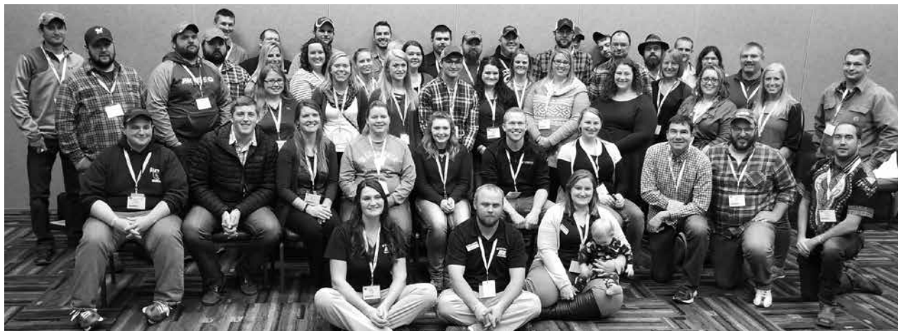
More than 60 YFA members from District 5 attended the YFA Conference held on December 1-3 at the Kalahari Resorts in Wisconsin Dells.