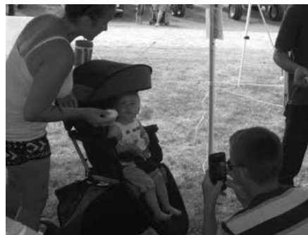
The interactive dairy promotion made some special memories for everyone.