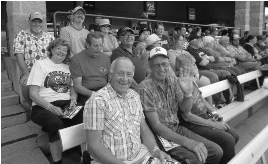
Outagamie County Farm Bureau members filled three rows of a section at the Timber Rattlers game last year. Join in the fun and camaraderie on August 18.