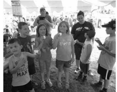
Butter making became a family affair for some.