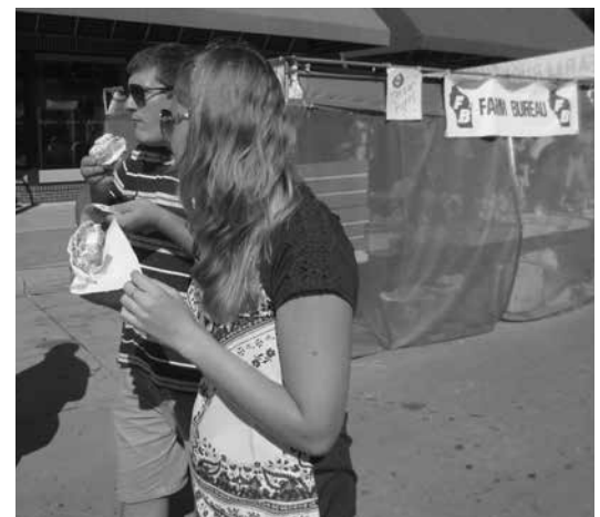
Farm Bureau cream puffs walk away fast. Keep the supply coming by helping at this year's event.

To volunteer in the booth on Saturday, September 30, please call 920.766.9377 and let us know when you can work and if there is a specific task you prefer to help with.