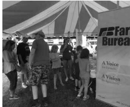
All ages got into the butter making process.