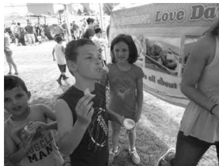
Crackers were provided to taste test the hand-made treat.