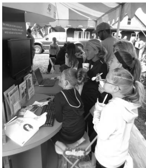
The My American Farm video game kiosk drew a crowd at the Breakfast on the Farm.

youngsters about agriculture in a fun way. The games cover a range of grade levels, and there are several games that are designed for each grade level from pre-kindergarten through the fifth grade. (They are fun for the whole family to play together, too, so check them out Mom and Dad) The games and many other fun resources can be accessed from your home computer at www.myamericanfarm.org .