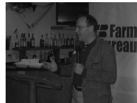
Keynote speaker Senator Tom Tiffany addressed the group about ag issues and his experiences in the state legislature.

Guest speaker, 12 th District Senator Tom Tiffany, discussed his experiences in the state legislature and many issues facing agriculture.