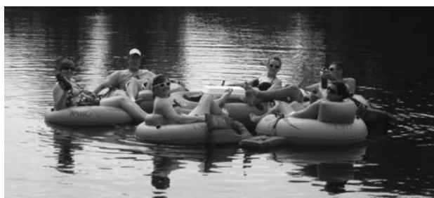
District 7 Young Farmer and Agriculturist members spent a beautiful summer Sunday floating down the Wolf River near Shawano.

Farm Bureau involvement doesn't have to be all work and no play. On Sunday August 10, District 7 YFA members had a little fun in the sun floating down the lazy Wolf River near Shawano.