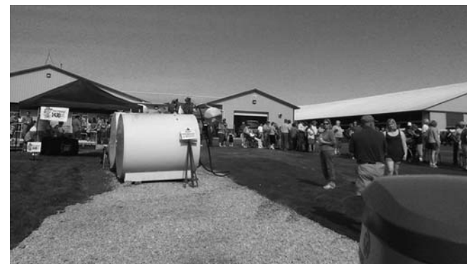
Attendees to the Pierce County Dairy Breakfast enjoyed beautiful weather as they toured Son-Bow Farms, Inc.

Thank you to the Pierce County Dairy Promotion Committee, Pierce County Farm Bureau and Wisconsin Milk Marketing Board for sponsorship of this great event.