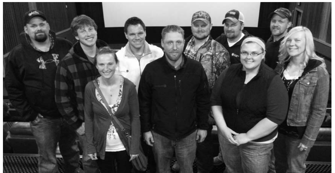
YFA members from District 9 travelled to Oakdale, MN to see a showing of the new film, "Farmland".