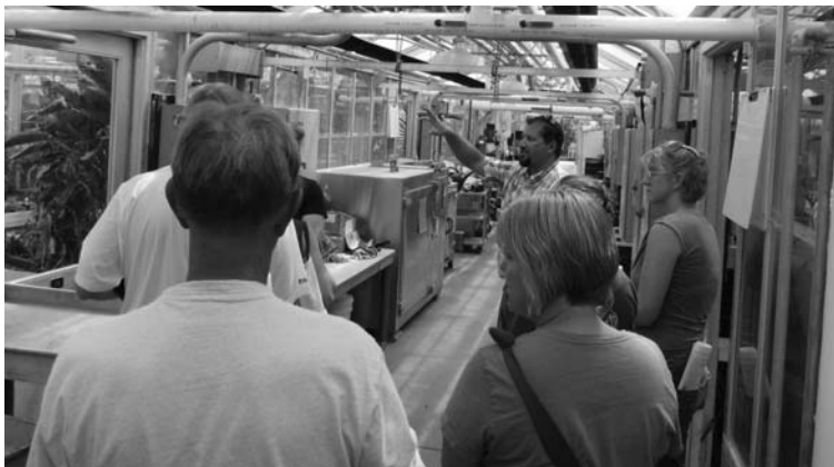
The group toured the UW-River Falls greenhouse facility.