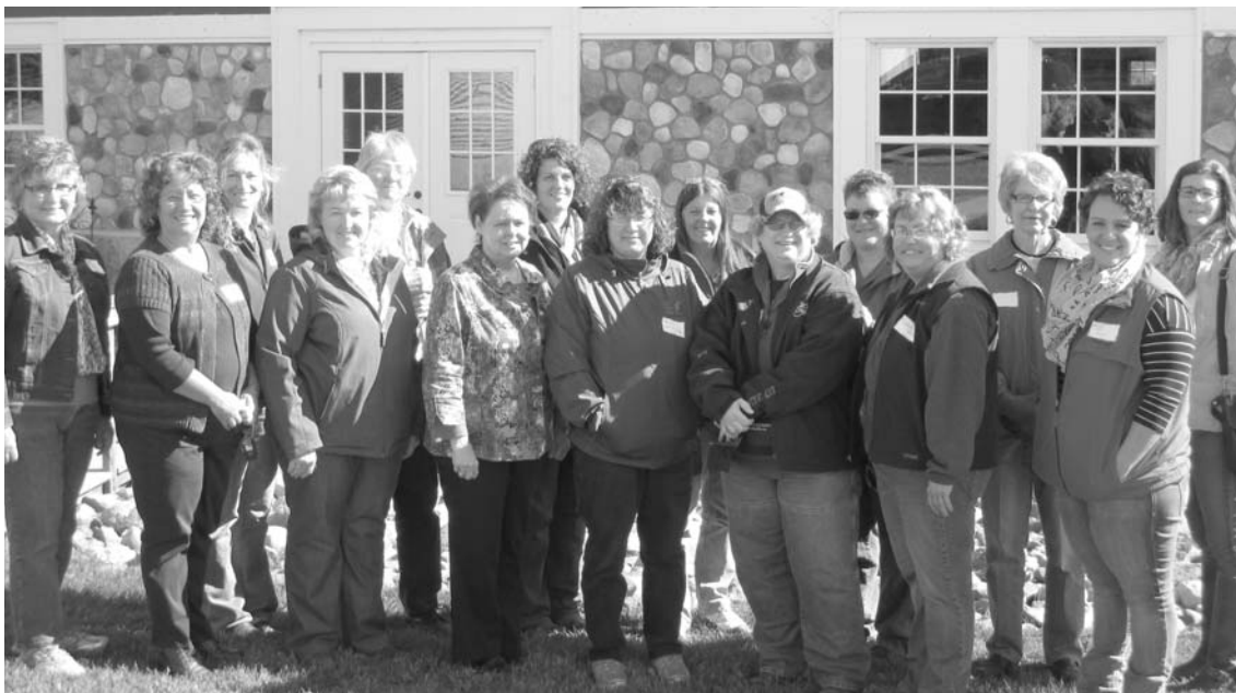
Women from Barron, Dunn, Polk, Pierce and St. Croix counties attended the District 9 Fall Women's Summit. We even had visitors from Hancock, Iowa and Hastings, Minnesota!