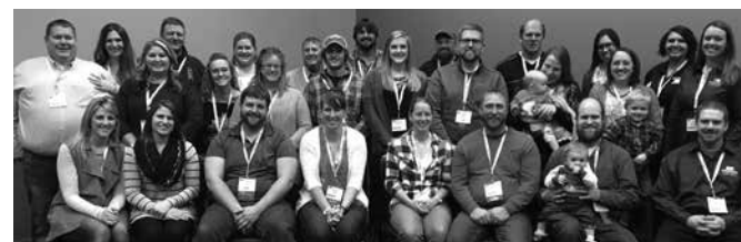
District 9 was well represented by Young Farmers and Agriculturists at the YFA Conference

More than 1,100 Young Farmer and Agriculturist and Farm Bureau Members converged on the Kalahari Resorts in Wisconsin Dells