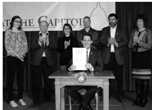
Attendees to Ag Day at the Capitol saw Governor Scott Walker sign an executive order that provides markets for family farmers and agribusinesses.

Ag Day at the Capitol is the largest lobby day for Wisconsin agriculture. Each year, farmers and agriculturists representing all facets of the state's diverse agriculture landscape come to Madison to learn more about state issues affecting agriculture and meet with their state legislators.