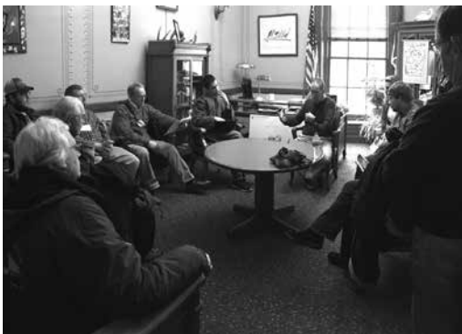
Members met with elected officials and their staff to talk about issues that are important to Polk County and Wisconsin Agriculture.

Members also were briefed about hot topics in