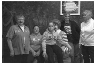
Members of Racine and Jefferson County Farm Bureau helped pack lunches at the Ronald McDonald House.

Our task was to assemble and package foods for the guests to select their own lunch items as they left for long days at the hospital. Along with a mom and her two school-age daughters, we made