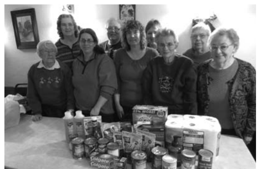
At their annual Christmas party, the SCFB women collected items to donate to the local food pantry.