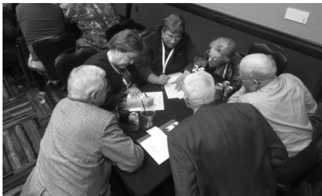
Above: SCFB team members deliberated questions during the Fun'd the Foundation Trivia Contest fund raising event.