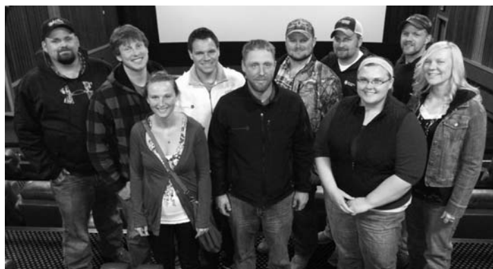
YFA members from around District 9 travelled to Oakdale, MN to see a showing of the new film, "Farmland".