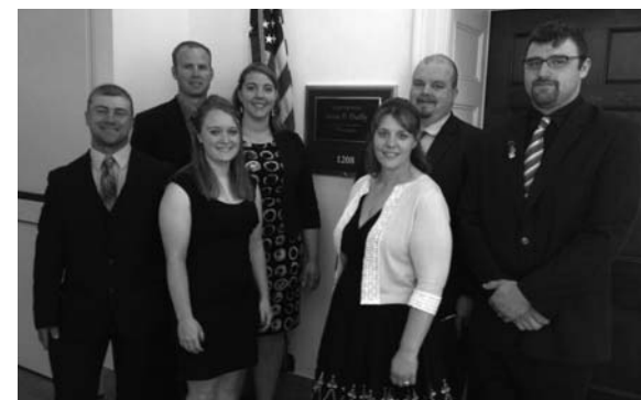
YFA members enjoyed their D.C. experience.