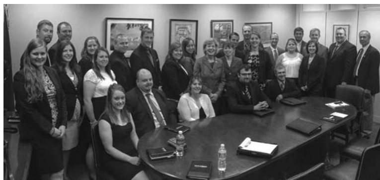
YFA members posed for a photo with Senator Tammy Baldwin.

The YFA Washington, D.C. trip is sponsored by Rural Mutual Insurance Company and Growmark FS. The event is designed to give young farmers and agriculturists an opportunity to further explore leadership, see how farm bureau policy works and give them a first-hand experience of Farm Bureau at a national level.