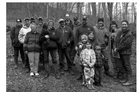
We had a great turnout for a maple syrup educational day.