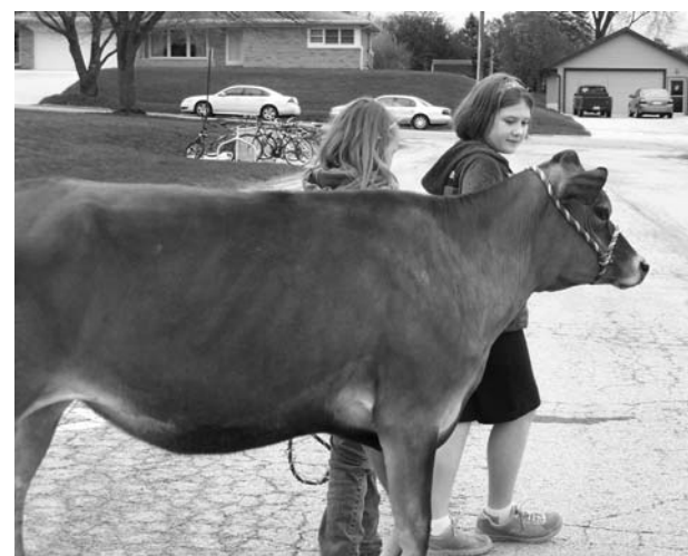
Each student got a chance to lead a calf around the parking lot.