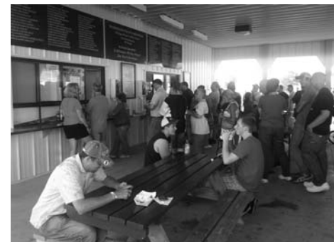
There were long lines at the Farm Bureau stand.

All volunteers are invited to attend our appreciation dinner and annual meeting for free on October 7 at the Columbian in West Bend. A separate invitation will be mailed to you.