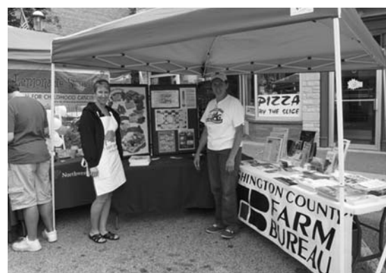
The Women's committee shared their knowledge during "Beef Promotion" at the West Bend Farmers' Market on Saturday, July 5.