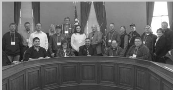
Members of Ozaukee and Washington County Farm Bureaus attended Ag Day and spoke to legislators at the Capitol.

Eleven WCFB members attended Ag Day at the Capitol for legislative briefings and capitol visits on January 29. The day began at the Monona Terrace Convention Center where we were briefed on current legislation issues and addressed by Governor Walker. The major topics that we were briefed on included implements of husbandry, groundwater, raw milk, use value assessment of farmland and