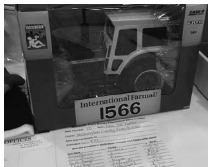
Auction item donated by Washington County Farm Bureau.