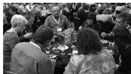
Washington County attendees enjoyed the banquet dinner.