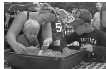
Attendees enjoying last year's Family Farm Weekend.

Farm Bureau volunteers will be helping at the Milwaukee County Zoo for the Family Farm Weekend. We look forward to seeing you at the Milwaukee County Zoo!