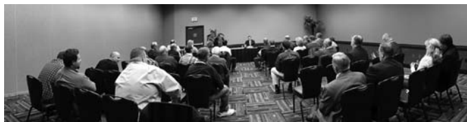
Waushara County delegates attended the District 5 caucus at the WFBF Annual Meeting.

Delegates at the Wisconsin Farm Bureau Federation's 95 th Annual Meeting in Wisconsin Dells established new policy directives for the organization on Monday, December 8.