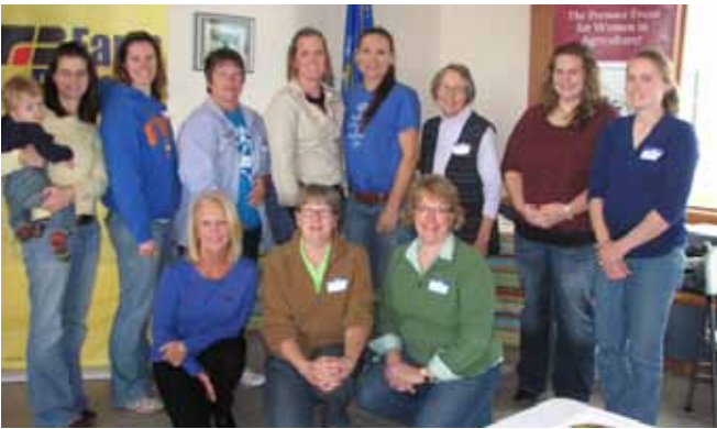
WFBF Women's Program focuses on women in agriculture and provides educational and outreach opportunities for counties.