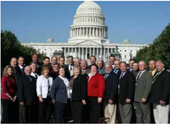
Sponsor members to travel to Washington, D.C. to meet with our nation's leaders