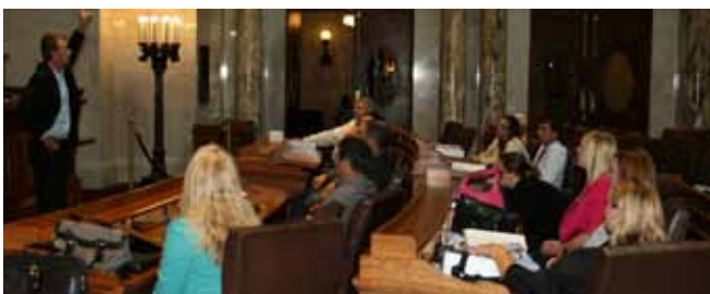
Provide staffing to implement statewide programs, influence ag policy and provide a voice for farmers.