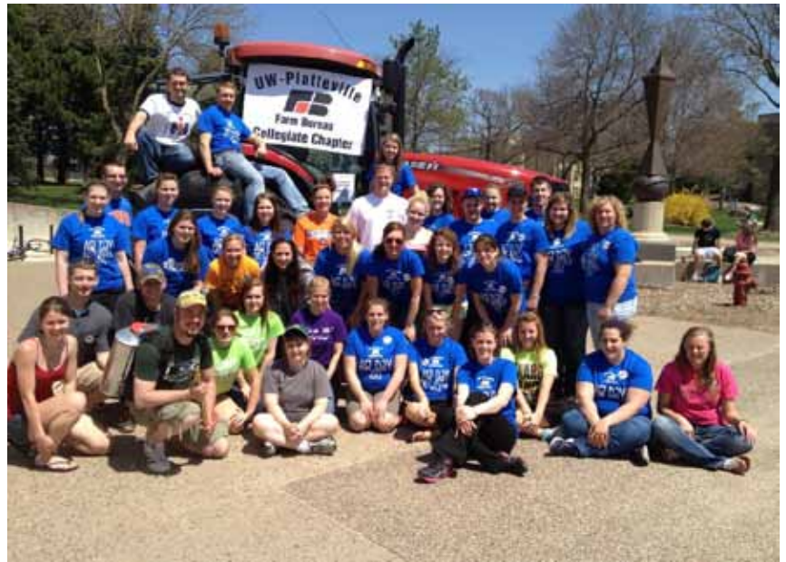
Provide support to Collegiate Farm Bureau Chapters.