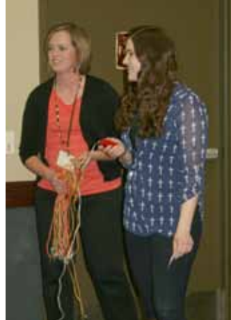
Provide staffing to assist county Farm Bureaus with local programs and events.