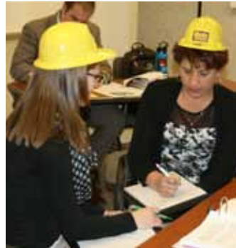
Provide leadership training to county Farm Bureau volunteers.