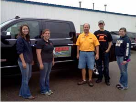
Work with business partners to provide money-saving discounts and member benefits.