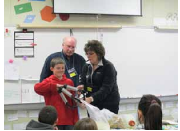
Support the Ag in the Classroom program and provide support for 4-H and FFA programs and awards.