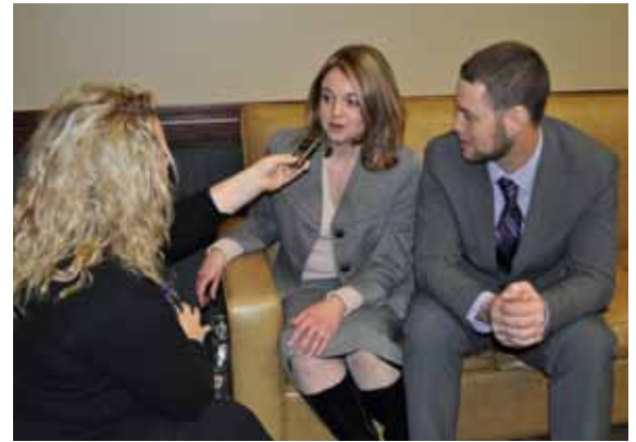
Work with print, broadcast and social media to educate consumers on ag issues.