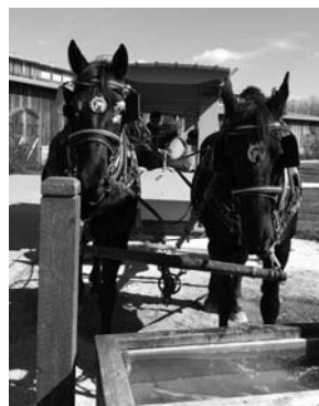
The women were taken by horse and wagon to the Wade House.