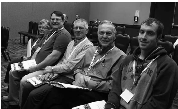
The delegates attended the district caucus.