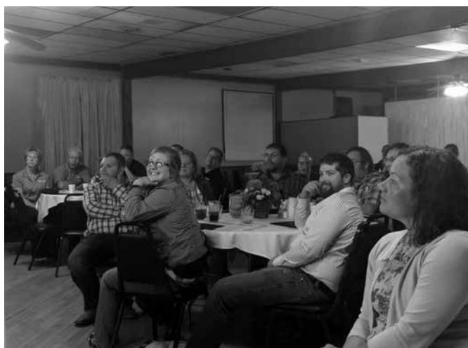
A group of about 55 members attended the Calumet County Farm Bureau annual meeting.