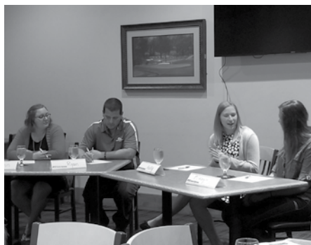
The District 6 Discussion Meet contestants had intense conversation.

Wish them the best of luck as they move on to the state competition on November 30-December 2 at the YFA Conference.