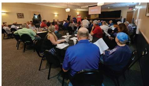
Attendees enjoyed the meeting.