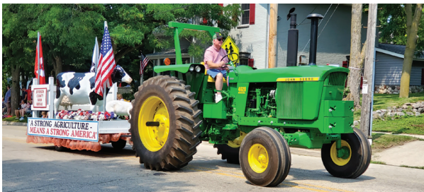
There was perfect weather for the Watertown Fourth of July parade.