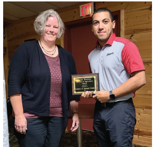
The Culvers of Johnson Creek was in attendance at the meeting to receive their award.

It is my pleasure to present the Jefferson County Farm Bureau Service to Agriculture Award to Culver's of Johnson Creek, Culver's of Lake Mills and Culver's of Whitewater.