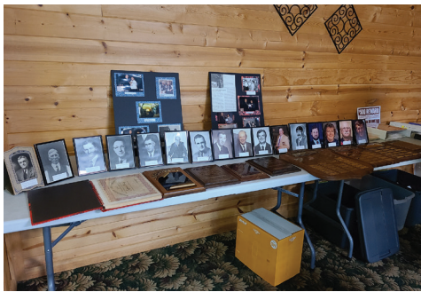
Board members set up a very nice 100-year display.