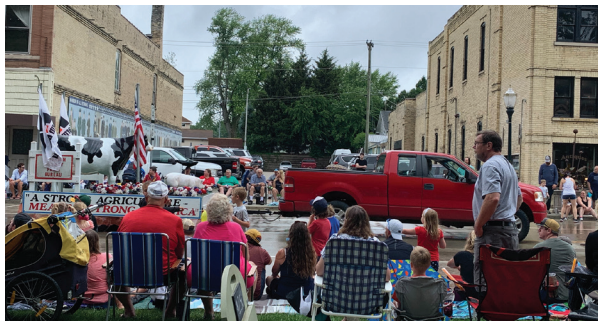
People lined the streets for the Town and Country Days parade.