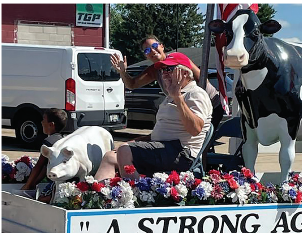
Waving to those watching the parade.