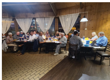
A great crowd at the annual meeting.