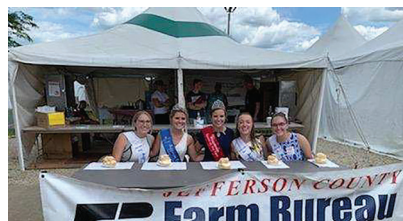
Fair Royalty cream puff eating contest.