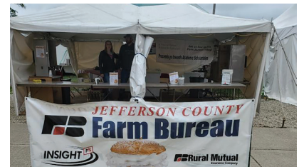
Ready to serve cream puffs, ice cream and milk.