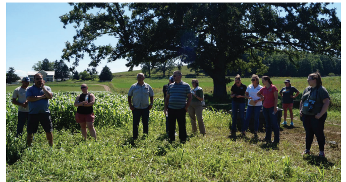
Members walked through the pasture to see what is planted and learned more about the cattle.

One tour was held in each of the nine districts throughout the state.