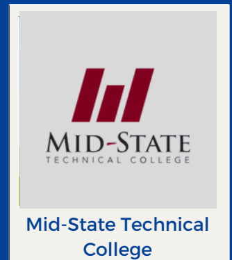
Mid-State Technical College