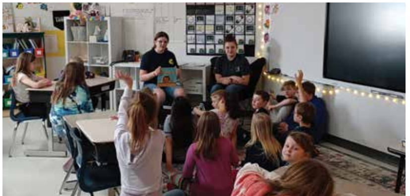
Omro FFA Students read books to Omro Elementary students on National Ag Day.