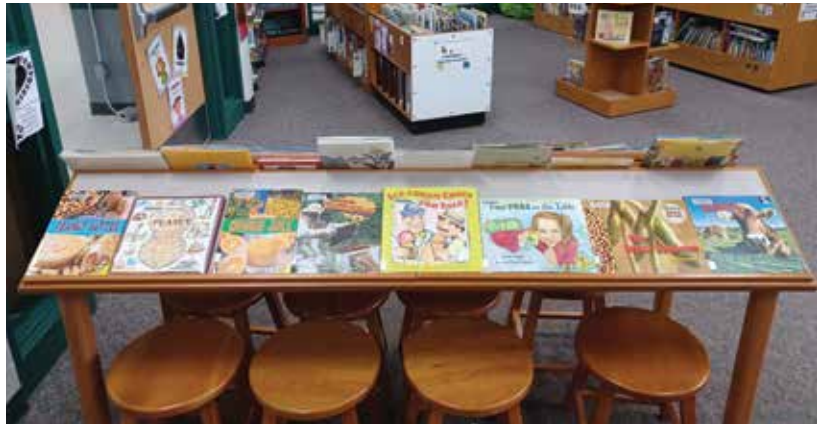
For National Ag Day on March 21, Omro Elementary assembled a display of agriculture books.