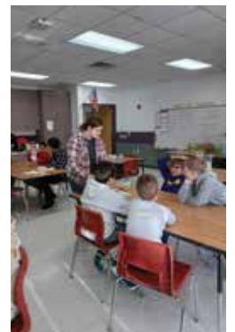
Omro FFA students made ice cream with 4 th and 5 th grade students in the Omro Elementary School.