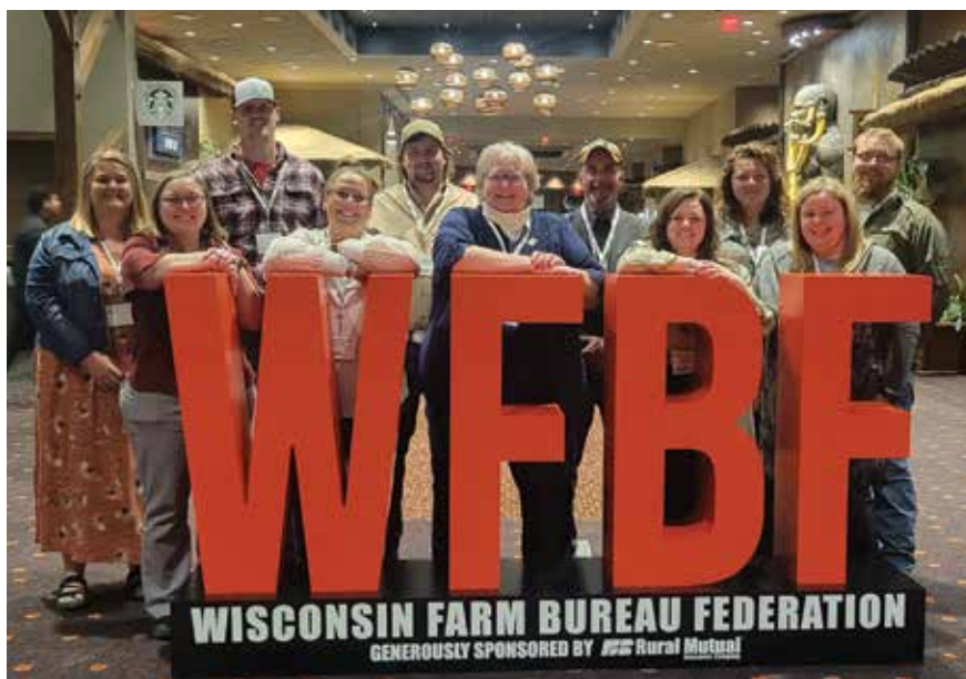
Excellent turnout for the WFBF Annual Meeting by Door County including two members participating in the YFA Discussion Meet.