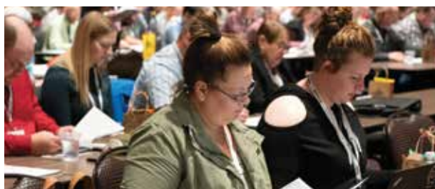
Door County delegates review the policy submissions before the delegate session Monday morning at the WFBF Annual Meeting.