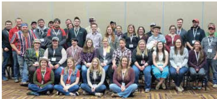
District 6 Young Farmer and Agriculturist members on Friday night's district meeting.