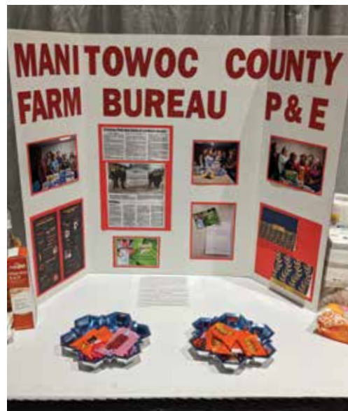
Manitowoc County Farm Bureau Promotion and Education committee was recognized in the County All-Stars program.