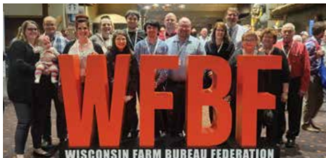
Manitowoc YFA and county delegates representing Manitowoc County Farm Bureau at the WFBF Annual Meeting.