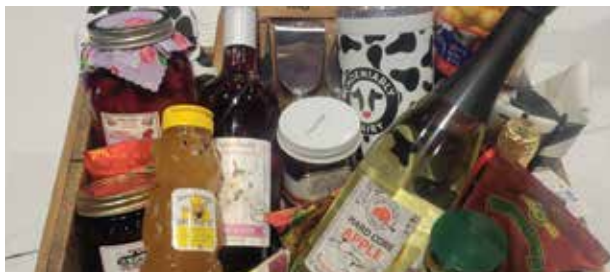
Door County Farm Bureau sponsored a basket for the silent auction, "A Taste of Door County".