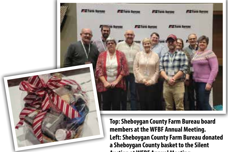
Top: Sheboygan County Farm Bureau board members at the WFBF Annual Meeting. Left: Sheboygan County Farm Bureau donated a Sheboygan County basket to the Silent Auction at WFBF Annual Meeting.