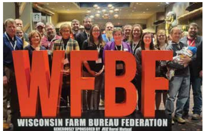
Calumet County was well-represented at the WFBF Annual Meeting and YFA Conference in December.