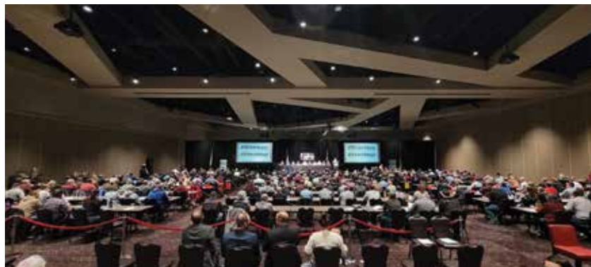
More than 230 delegates gathered for the policy development session during the WFBF Annual Meeting.