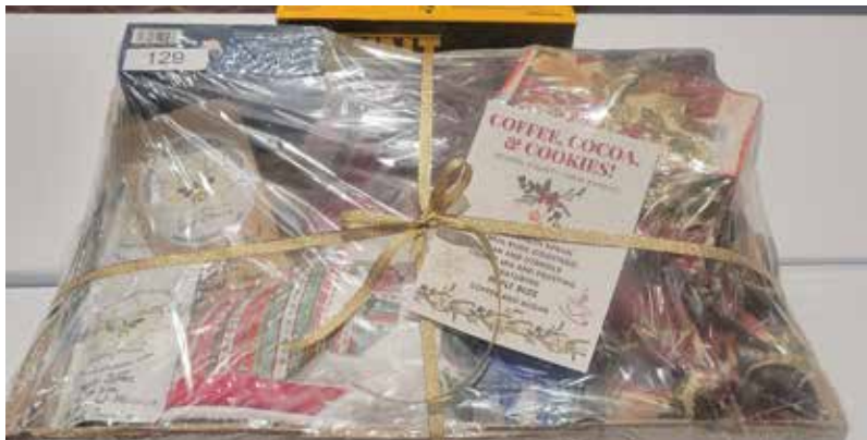
Coffee, cocoa and cookies basket donated by Brown County Farm Bureau for the Silent Auction.