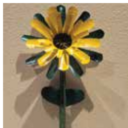
Manitowoc County Farm Bureau donated yard art (left) and a bird house, bird seed combo (right) to the Foundation Silent Auction.