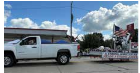
Steve Knoebel pulled the float in the Gemuetlichkeit parade.