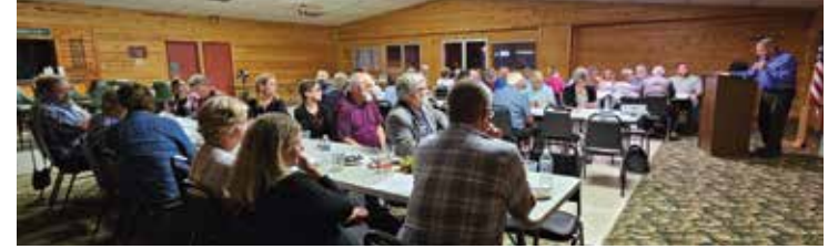
There were 47 total attendees and 28 voting members at the annual meeting on September 24 at Fairview Inn.