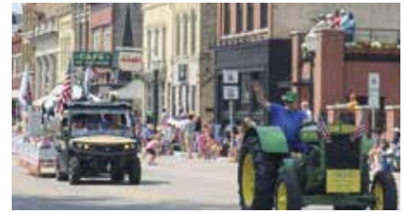
Community members lined the streets at the Lake Mills Parade.