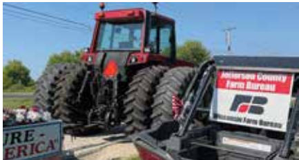
The side-by-side followed the float in the Ixonia parade.