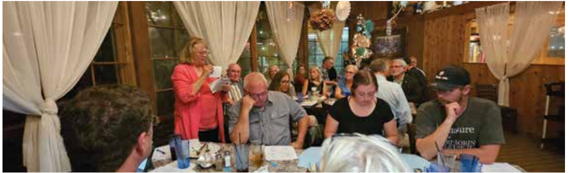
The annual meeting was held on September 26 at the Birchwood Grill. There were 17 voting members and 23 total attendees who enjoyed socializing, dinner and the meeting.