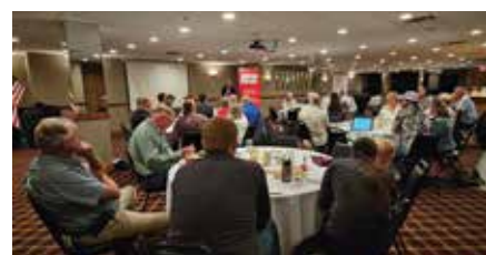
The annual meeting had a total of 31 attendees and 19 voting members.