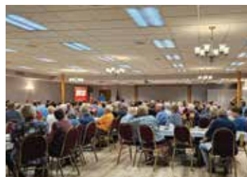
The annual meeting was held at Wilson's Whistle Stop. There were 52 total attendees and 42 voting members who voted on policy, directors and delegates.