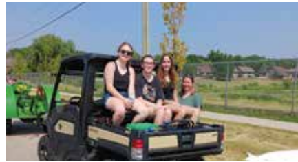
The candy throwing crew in the Lake Mills Parade.