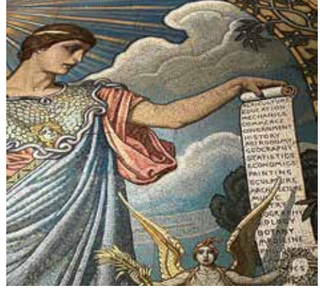
YFA members visited the Library of Congress. Did you notice where they put agriculture in this mural? Right at the top!

wfbf.com/about/counties/dane DaneCountyFarmBureau