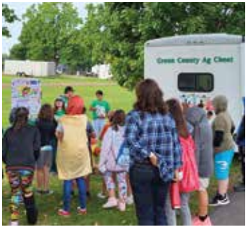
Green County Ag Chest graciously donated all of the ice cream that was served!