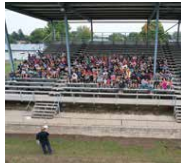
Our welcome with all the 5th graders present!

On September 20, Green County Farm Bureau hosted roughly 270 fifth grade students at the fairgrounds in Monroe for Rural Safety Day. Students rotated through stations that included grain bin safety, animal safety, fire safety, trailer safety, EMS, PTO safety, electrical safety, health services, ATV safety and chemical safety. This day was made possible by our generous sponsors and volunteers that graciously donated their time. It was a great way to celebrate National Farm Safety and Health Week in Green County!