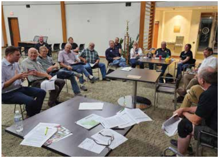
Farm Bureau members gather to discuss policy during the District 2 policy development meeting held on July 31 at the Verona Town Hall.