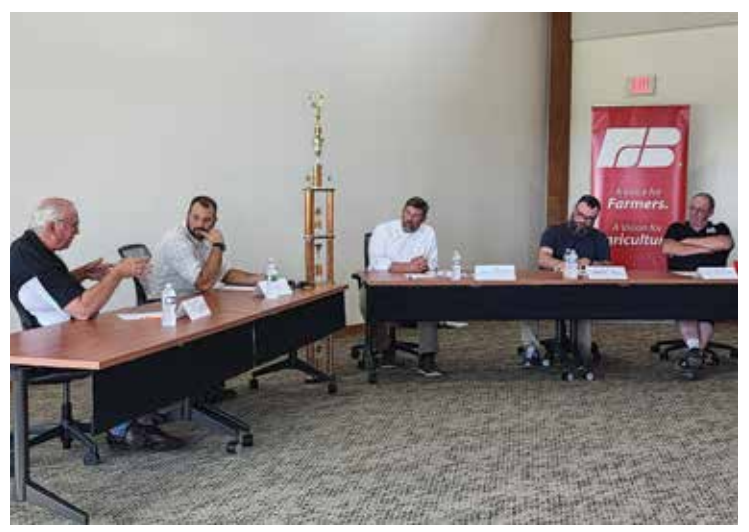
The discussion focused on the topic: "From wind to solar, alternative energy conversations have been rising to the top in many rural communities across Wisconsin. What role, if any, should Farm Bureau play in the conversations surrounding alternative energy, land use and policy to ensure that needs and wants of all members are met."

Initial discussions of this committee centered around activities and competitions that could foster and enable those who age out of YFA to continue participation and stay engaged in the Farm Bureau organization. After further discussions, the committee focused attention on hosting competitive events for those over 35 because there are currently few competitive award areas in the Farm Bureau organization for these members. The discussion meet contest was an easy way to make use of everyone's time, offer a new opportunity to those over 35 and worked well in conjunction with the D2 YFA Discussion Meet and policy development meeting. This committee is also interested in the establishment of other contest areas. The committee's goal is to continue to provide district and potentially statewide opportunities for those over 35. We hope that other districts may consider starting their own competition so we might eventually be able to hold a state contest.