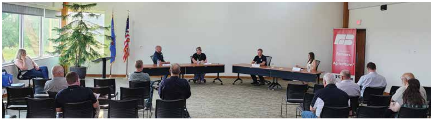
A great discussion was had on the topic: Production agriculture requires a lot of capital. Young farmers and ranchers face challenges gaining access to the capital they need to start or grow their operations. What tools are currently available, and what new programs could be introduced, to help young people access financial resources – and make sound financial decisions – to run their farms and ranches?

Like always if you have any questions about the YFA program or have ideas for events please reach out to us! We're looking forward to another year representing District 2 on the WFBF YFA Committee.