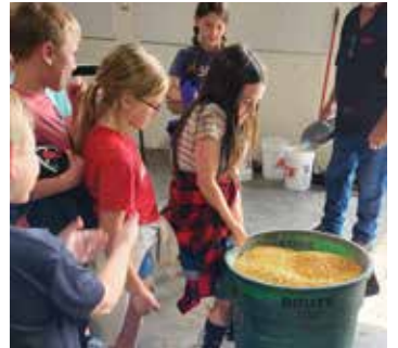
Students were able to try to get a pair of work boots out of corn with a rope tied around! The corn creates so much pressure!