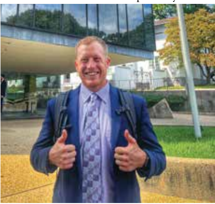
At the Brazilian Embassy we were updated about Brazil's outlook on specifically agriculture.

I will be forever grateful for this experience and sharing it with many others that helped make it that much more enjoyable!