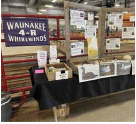
Waunakee Whirlwinds 4-H poultry project was awarded a Dane County Farm Bureau Ag Educational Grant to help create a display in Learning Lanes at the Dane County Fair.