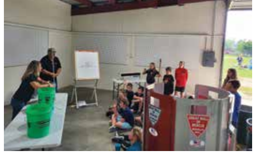
Eastland Grain teaching Grain Bin Safety! The "Great Wall of Rescue" is what emergency responders use to help someone trapped in a grain bin.