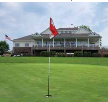
There was a four-way tie to be broken during the ball toss.