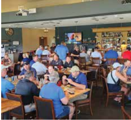
Over $8,300 was raised during the District 2 Golf Outing Fundraiser.

The event took place on August 8 at the Oaks Golf Course in Cottage Grove. The weather was perfect for a golf outing and everyone enjoyed the day. The activities for the day were: hole-in-one prizes, hole events, 50/50