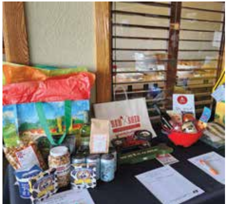
Each county in District 2 contributed silent auction items for the golf outing fundraiser.

raffle, silent auction prizes, ball toss, and putting contest. The outing was a best ball event with a lunch served on the course followed by a buffet of snacks during the program.