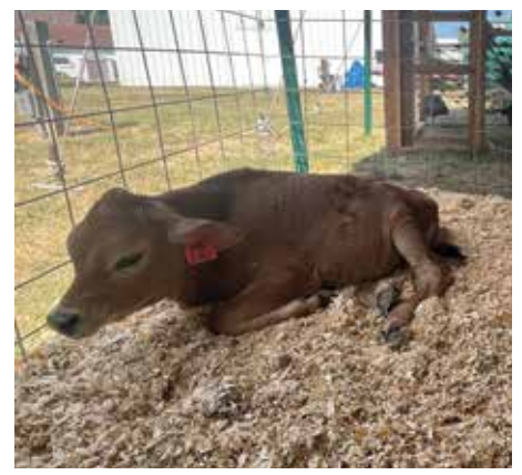
Committee members were active at the Lodi Ag Fair earlier in July, volunteering around the fair and organizing the Barnyard Babies tent.