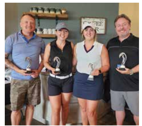
The D2 Golf Outing winning team.