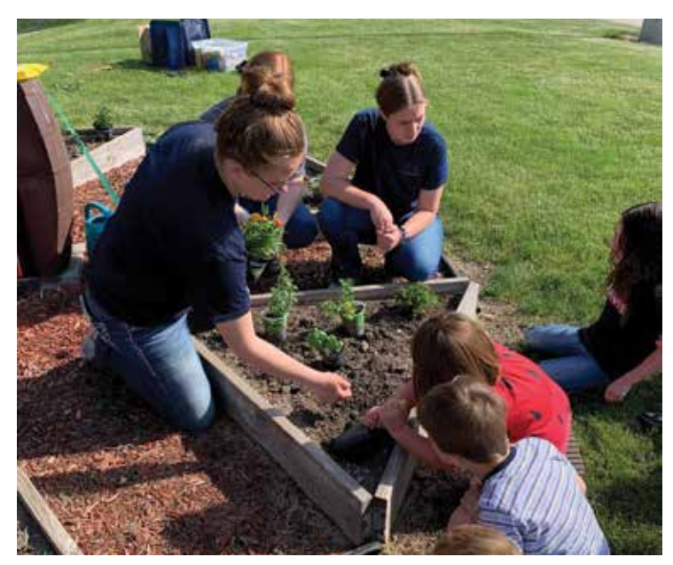
Milton FFA students are teaching the kindergarten classes at Milton East using the Pizza Garden. The pizza garden is a self-sufficient garden shaped like a pizza. Kindergarten classes learn about all of the ingredients in a pizza and have the opportunity to plant the entire pizza garden at their school. The garden is then cared for by kindergarten families during the spring and summer. Families can harvest the produce to take home.

role. I'm interested in being a Green County Farm Bureau board member to help promote agriculture and to gain leadership opportunities and skills.