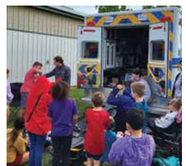
Green County EMS covering "Stop the Bleed" and how to handle emergency situations!