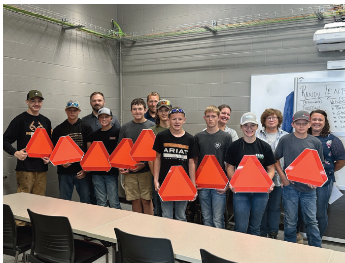
The Waushara County Farm Bureau donated SMV (Slow Moving Signs) for all the graduates of the Tractor Safety program offered through Fox Valley Technical College.

Promotion and Education Update: We are looking for new opportunities in the Promotion and Education space. Please let me know if you had of any events that would give us access to consumers. We are looking to implement a few events over the next year.