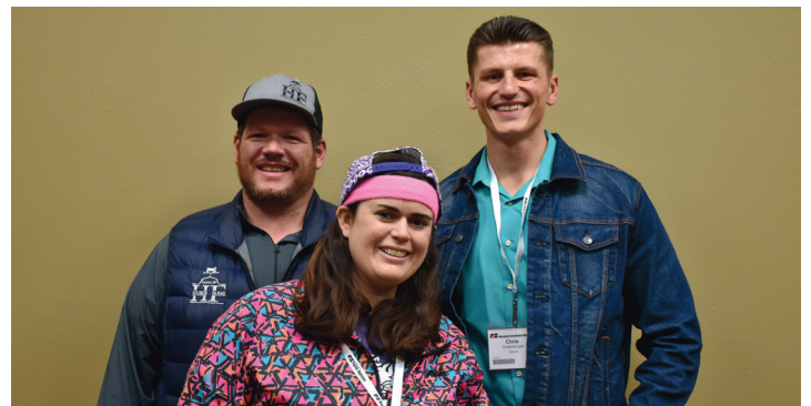
Adams County Farm Bureau members attended the WFBF YFA Conference held December 1-3 at the Kalahari Resort in Wisconsin Dells.