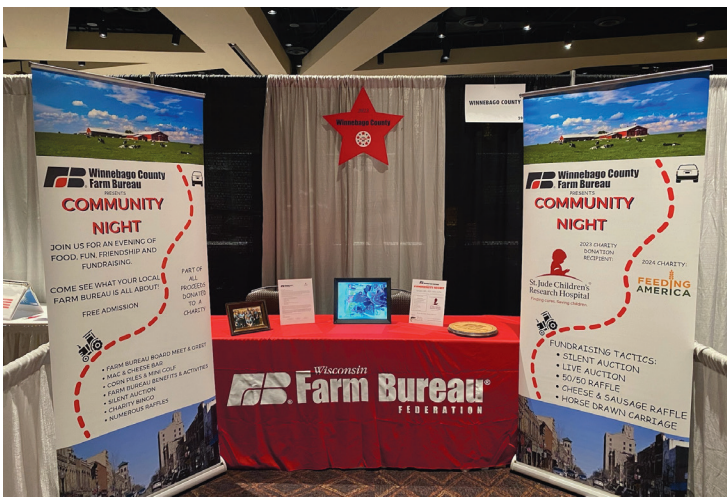
Winnebago County Farm Bureau was awarded a WFBF County All-Star Award and an AFBF County Award of Excellence for the Community Night event that was held in February and proceeds from the event were donated to St. Jude's.