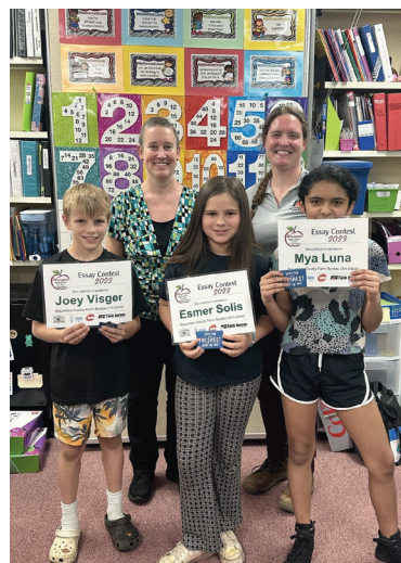
2023 County Ag in the Classroom Essay Winners