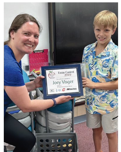
2023 Waushara County Ag in the Classroom Winner