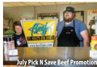
July Pick N Save Beef Promotion

Hello everyone! I did a two-hour beef promotion at Pick N Save in Antigo on July 3. It was suggested that I get more travelers for both the Fourth of July and the Hodag Festival in Rhinelander. The event went quite well, and I had many people sample the in-store meatballs I made. I did get the Ground Chuck on sale at $3.49/lb. in three-pound packages with the sale ending July 4.