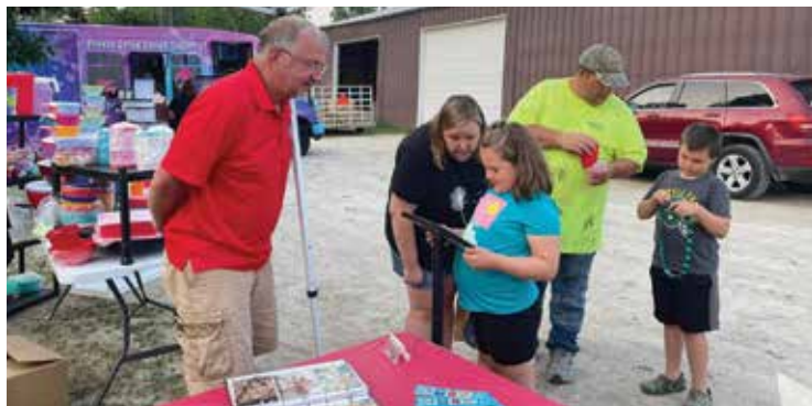
Visitors at Friday on the Farm got a taste of the My American Farm video games available at the myamericanfarm.org website.