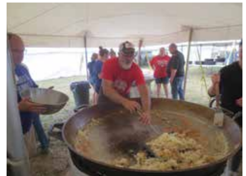
A large number of dedicated volunteers kept the food supplied to the serving lines.

Save the date for June 23, 2024, for next year's Brunch on the Farm! If you know a farm interested in hosting Brunch, please send a nomination to shawanobrunch@gmail.com.