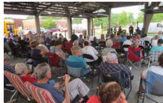
A great crowd at Music in the Park made for a great fundraiser.