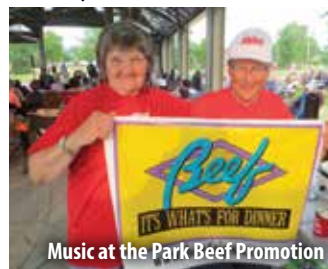
Music at the Park Beef Promotion

This year the Wisconsin Beef Council did not offer a $250 grant, which would have helped. I used some of the promotional materials and recipes from years past. Langlade County Farm Bureau served beef BBQs at the June 5 Music in the Park, and that was a beef promotion as well. We had a pretty good turnout at that, too, and hats off for a job well done to anyone who helped with the food and serving.