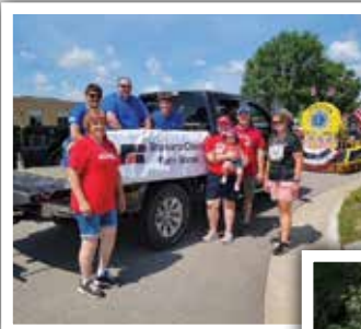
Left: Shawano County Farm Bureau members and Shawano Ag Ambassadors handed out string cheese at the Gresham Parade on July 1.