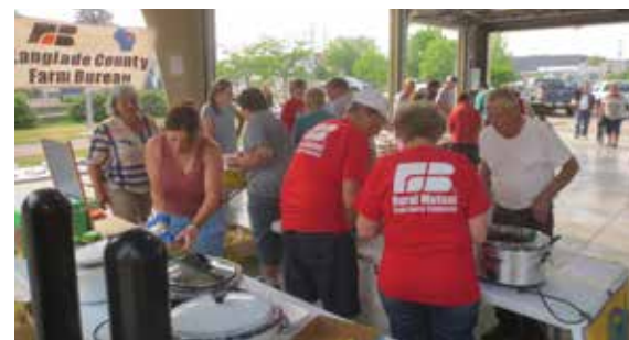
All hands on deck for serving at Music in the Park.

We had good weather, a great band and a large crowd. The venue was moved to the pavilion and still worked out well. We had all hands on deck which made the work so much easier. Thank you to everyone who came and supported Farm Bureau.