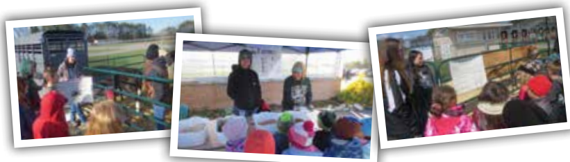
Coleman elementary students learned about Marinette County agriculture during AgVenture Day.

On April 25, the Marinette County Farm Bureau collaborated with the Coleman FFA to put on AgVenture Day for about 300 elementary school students at Coleman. The FFA student leaders educated the kids about different agricultural topics at several stations in the Coleman High School parking lot.