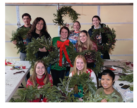
YFA members made Christmas wreaths to decorate their homes.