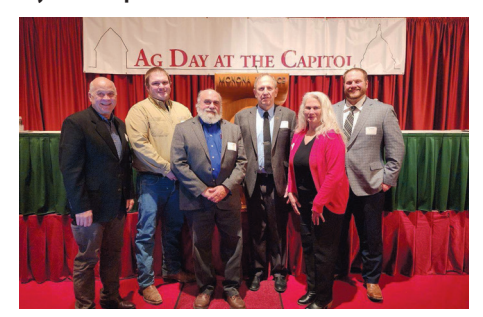
Rock County Farm Bureau members

remarks of keynote speakers, members walked up to the Capitol to meet with legislators to have meaningful discussions about issues affecting their rural communities.