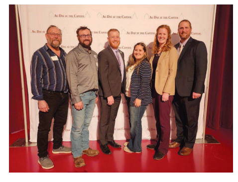
Green County Farm Bureau members

remarks of keynote speakers, members walked up to the Capitol to meet with legislators to have meaningful discussions about issues affecting their rural communities.