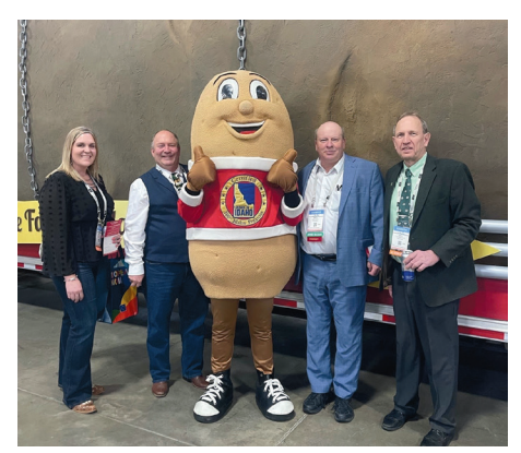
WFBF board members pose with Spuddy Buddy at the AFBF Annual Convention Trade Show.